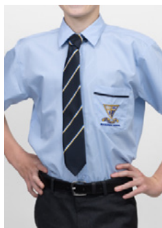
Detail of shirt and tri-striped tie