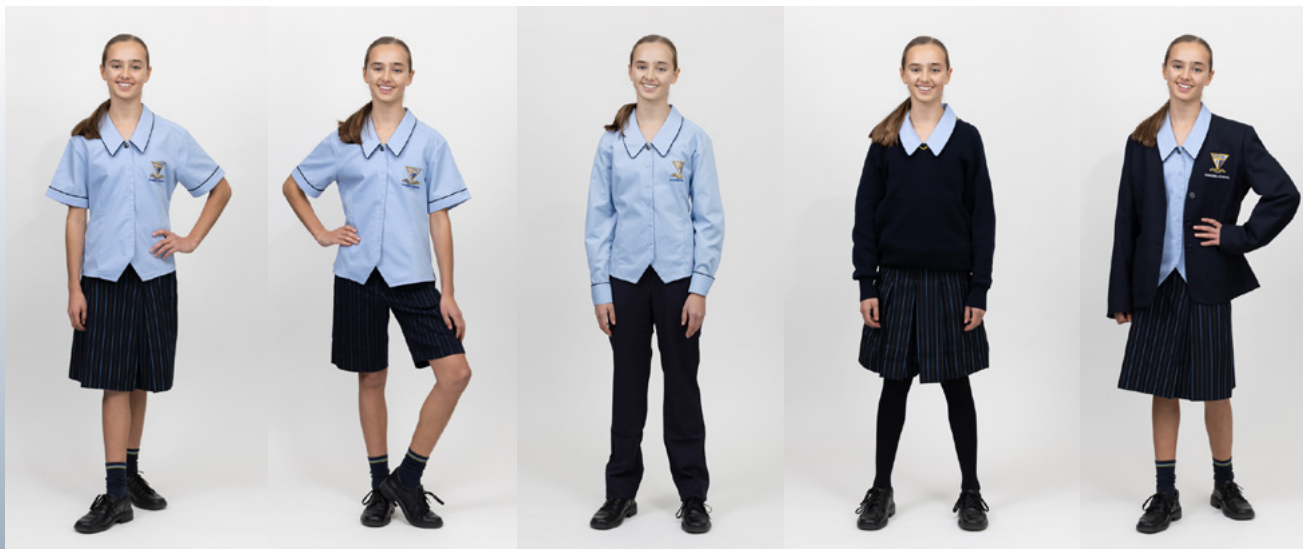
Skirt with short-sleeved blouse