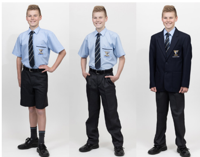
Shorts with short-sleeved shirt and tri-striped tie