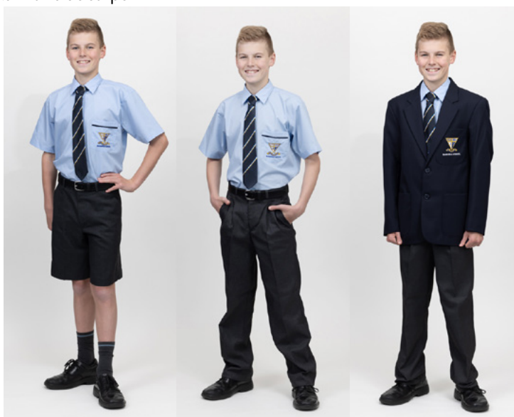
Shorts with short-sleeved shirt and tri-striped tie