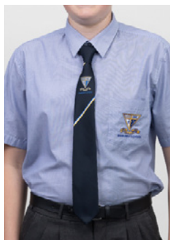
Detail of pin-stripe shirt and Senior tie