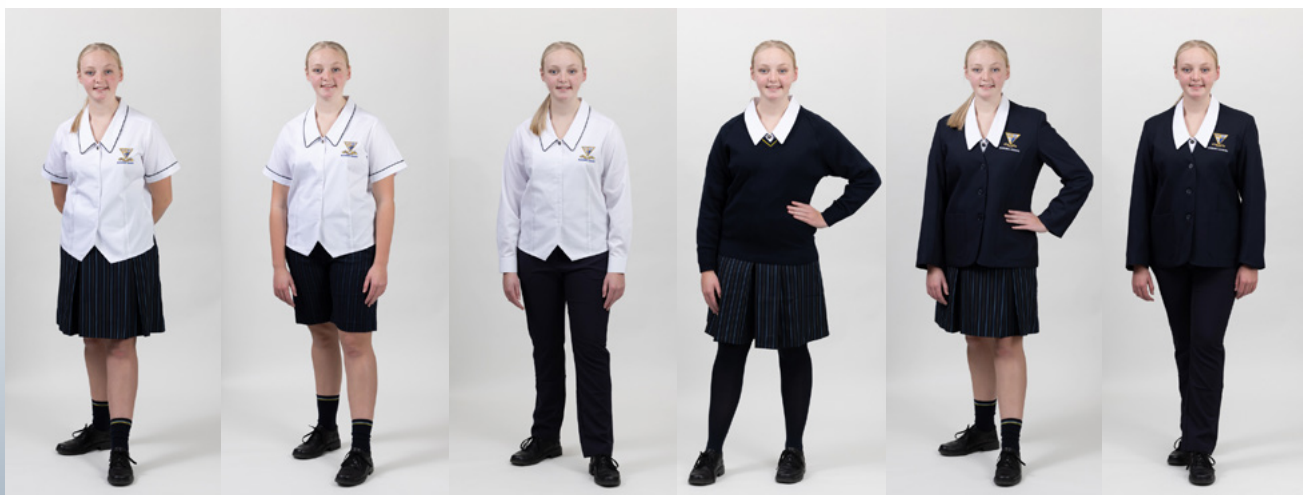
Skirt with short-sleeved blouse