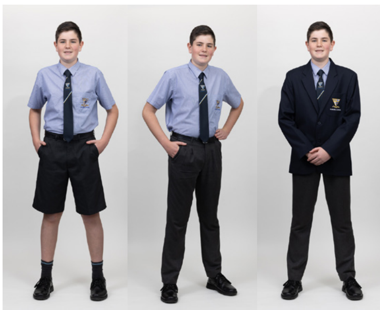
Shorts with short-sleeved shirt and Senior tie