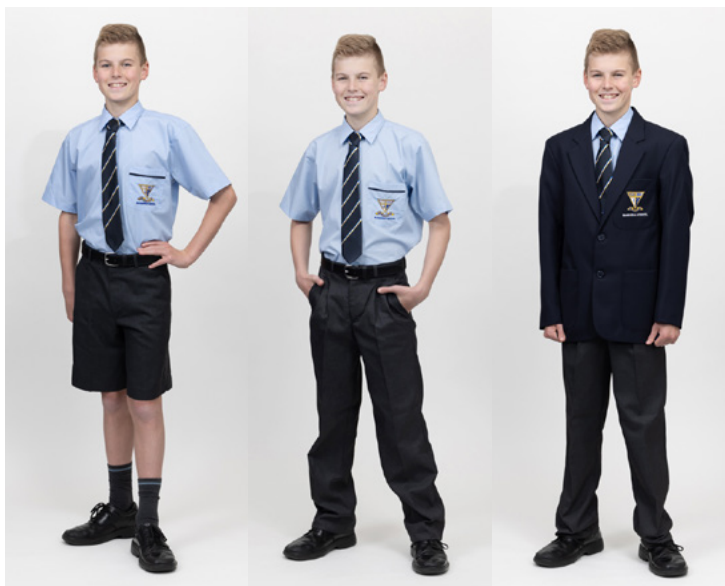
Shorts with short-sleeved shirt and tri-striped tie